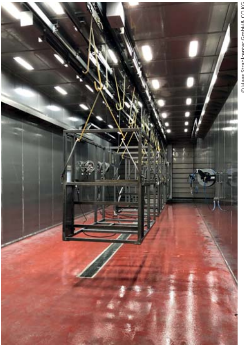
The rollover washing system.