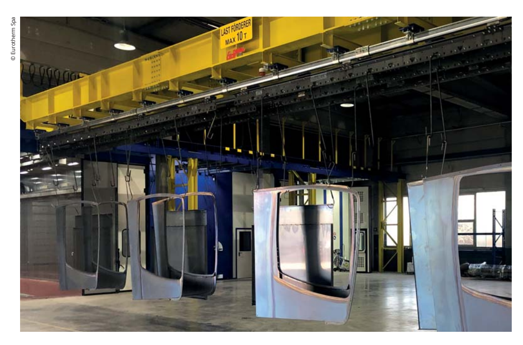
The conveyor handles workpieces with weights up to 15 t.

Established in 1997 as a small sandblasting contractor with only five operators, over the last two decades Haas Strahlcenter has become one of the major players in the coating contracting industry of southern Germany. Its first growth steps were opening a second production plant in the industrial area