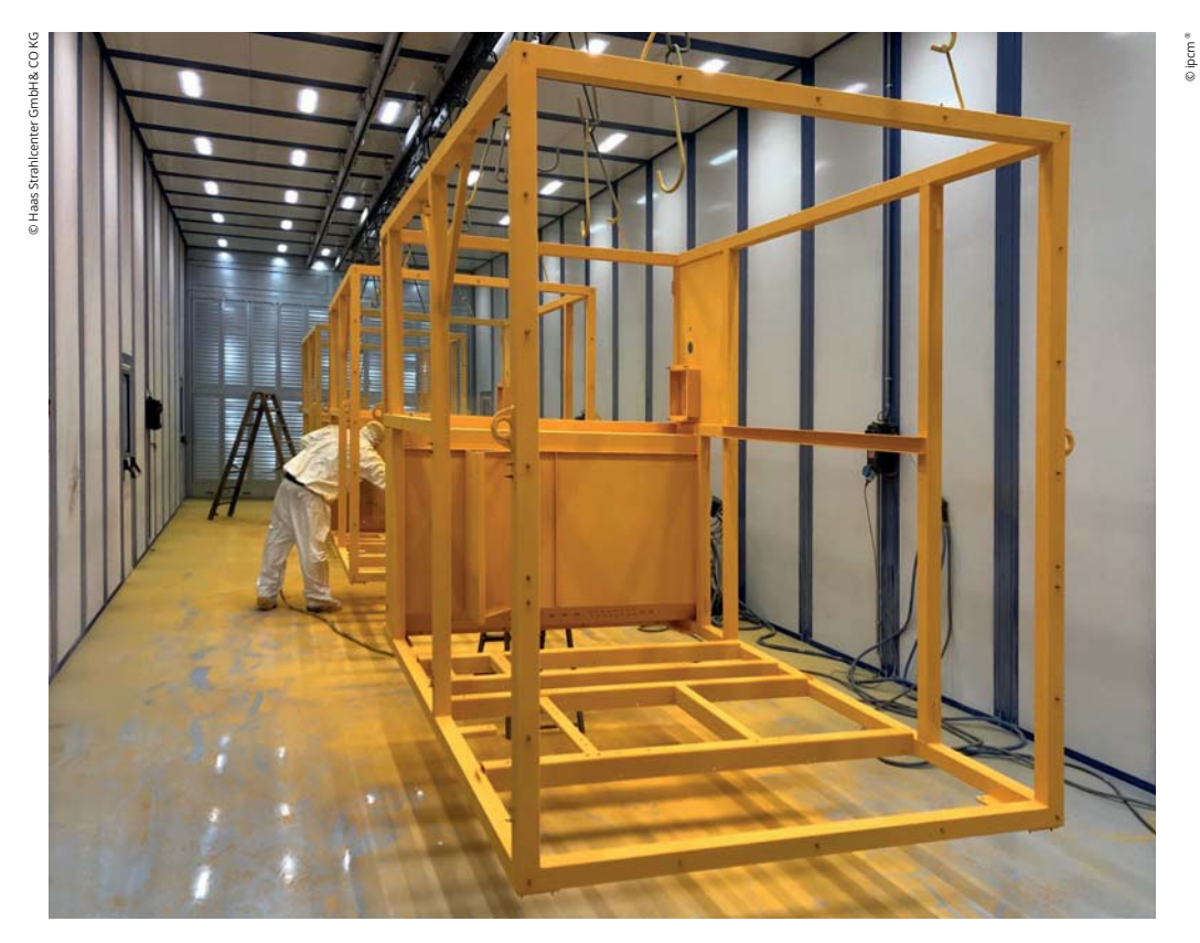
The powder coating booth.