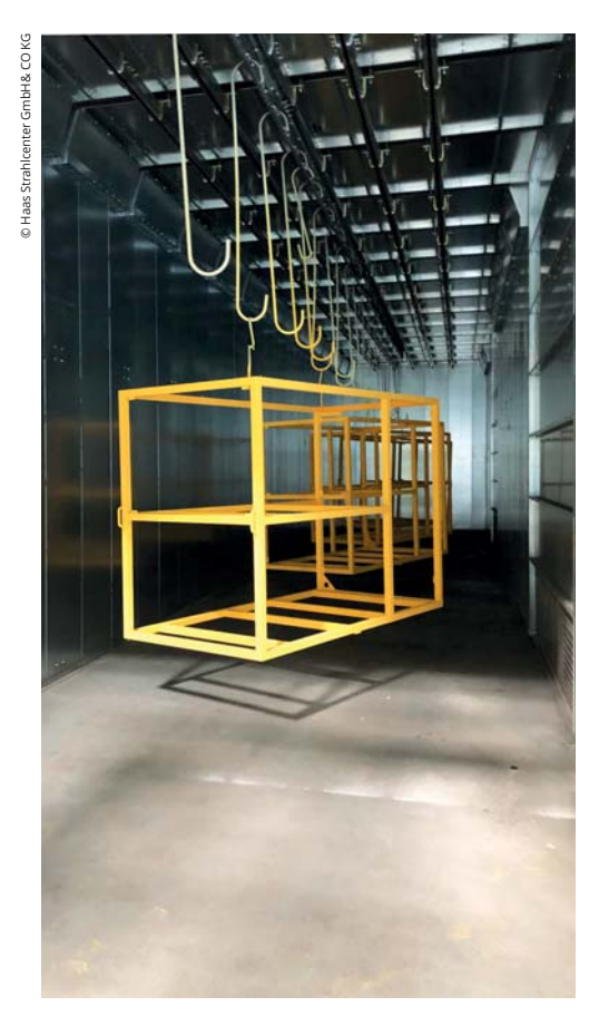
The interior of the oven.

The insulation consists of modular panels in galvanised or coated sheet metal, arranged to form an internal and an external layer not thermally connected to each other, so as to avoid thermal bridges. On the inside, three layers of high-density (100 kg/m³) rock wool panels, with a total thickness of 150 mm, are an effective barrier to heat dispersion.