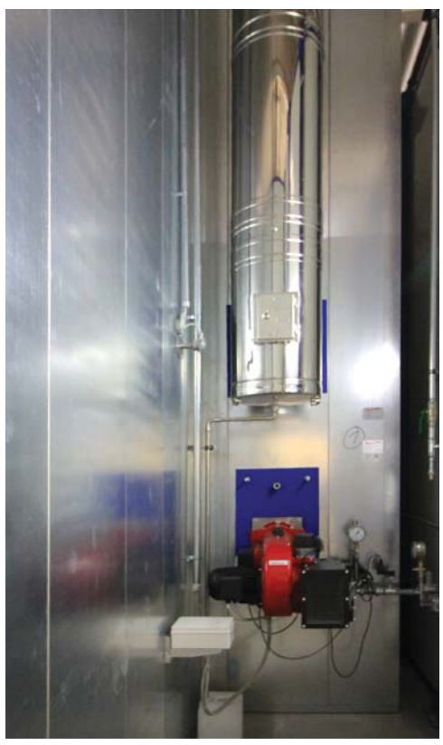
One of two burners with which the curing oven is equipped.