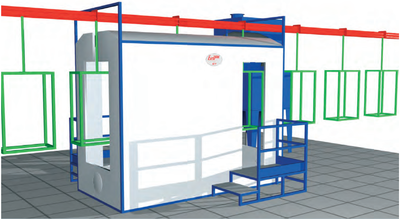
Range equipped with auto-cleaning filtering cartridges