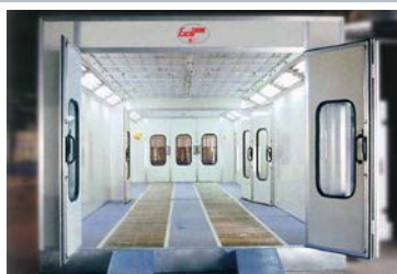
Standard booth inside