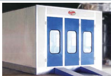
Standard spray booth