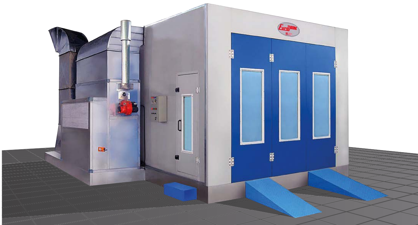
Pressurized booth specially for car body repair With vertical airflow and oven mode