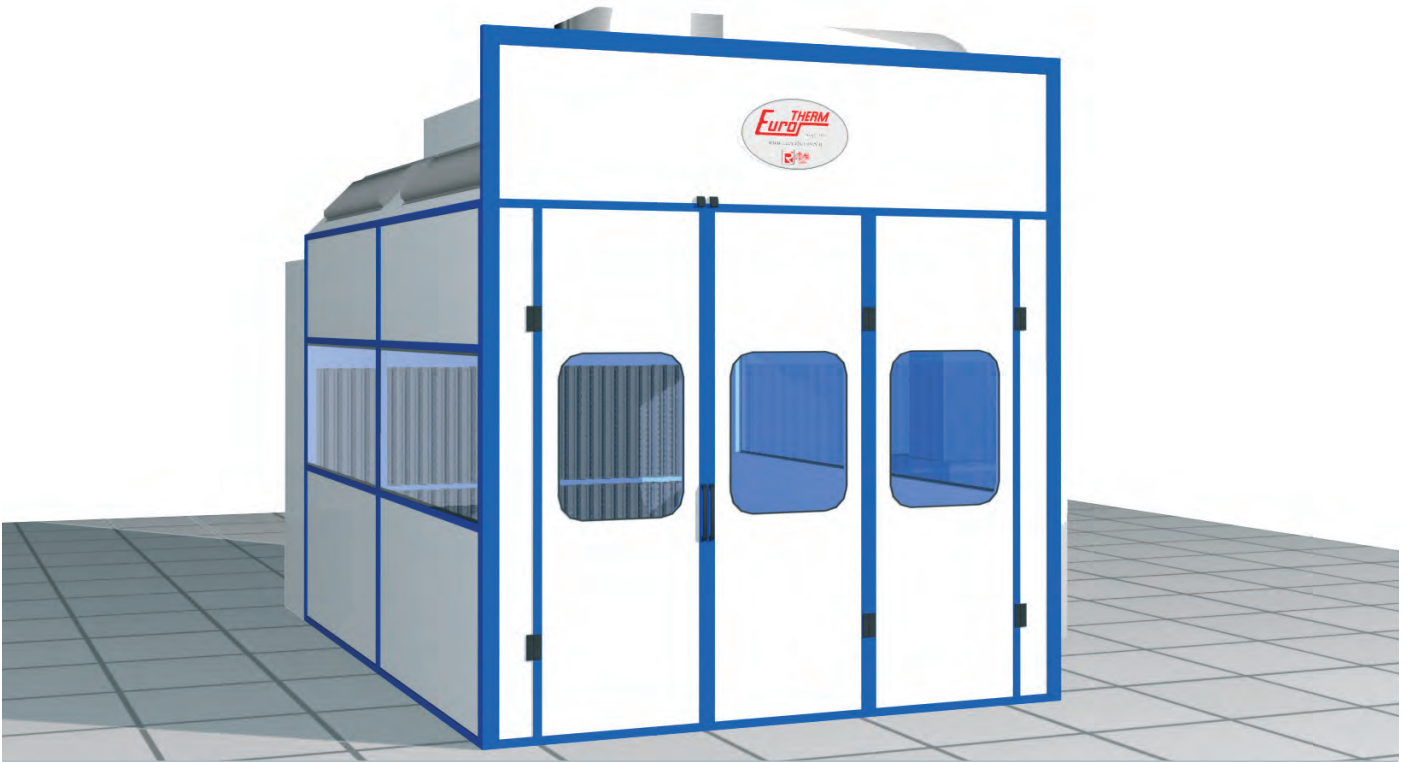
Range for car body with semi-vertical airflow