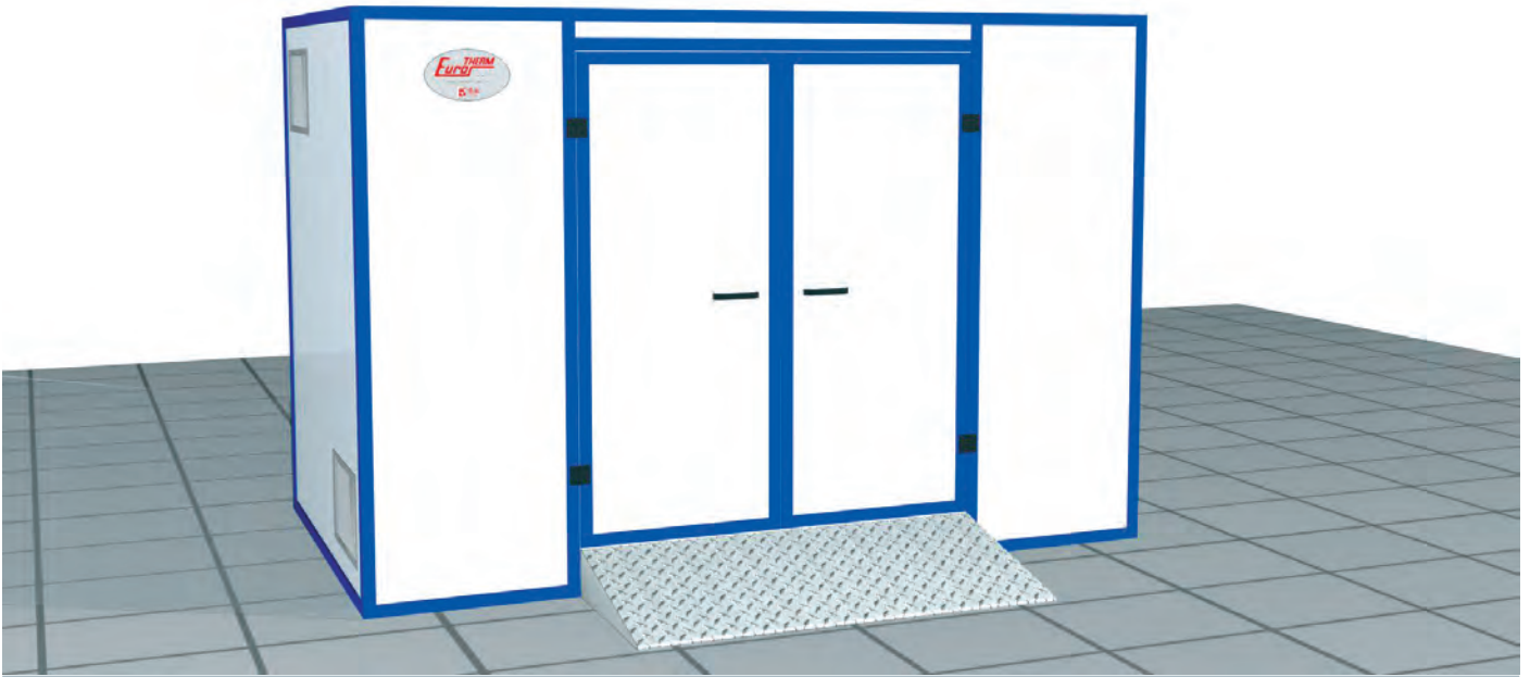
Range with floor grill and tank recovery