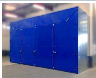
For large pieces