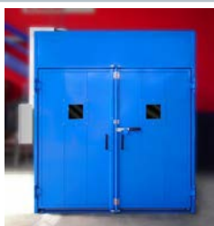
With inspection windows