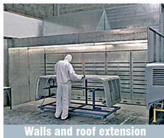
Walls and roof extension