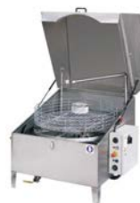
Euro LSMCA4 / 5